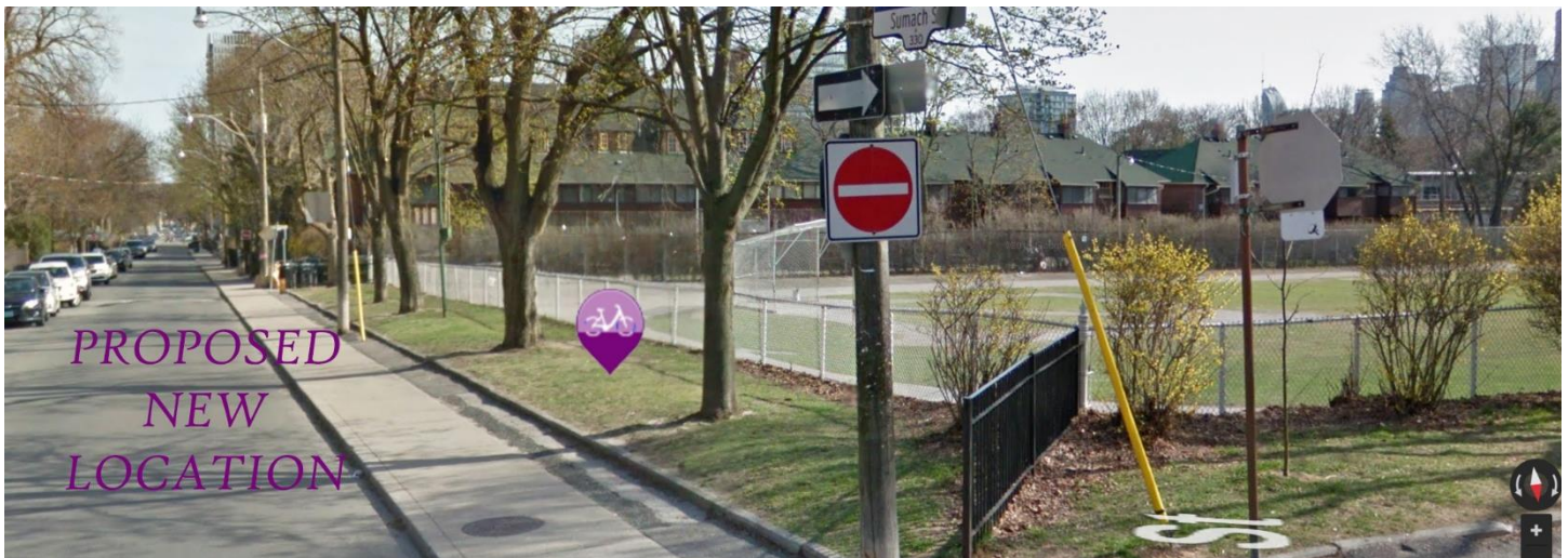
FIGURE 2 – STREET VIEW OF SUMACH ST & CARLTON ST

Please feel free to connect with me to discuss the issue further. We look forward to hearing from you in the near future.